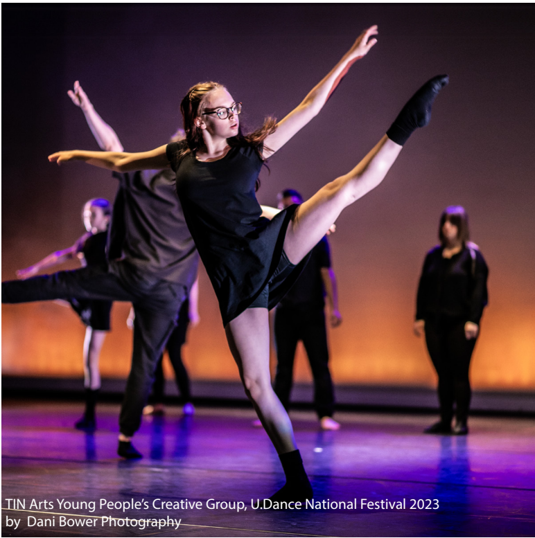
TIN Arts Young People's Creative Group, U.Dance National Festival 2023

National Youth Arts Wales nyaw@nyaw.org.uk