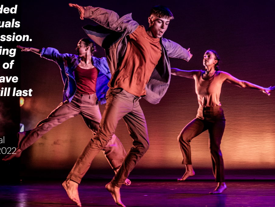
Lothian Youth Dance, U.Dance National Festival 2023

Group Leader, U.Dance Regional Platform and National Festival 2022