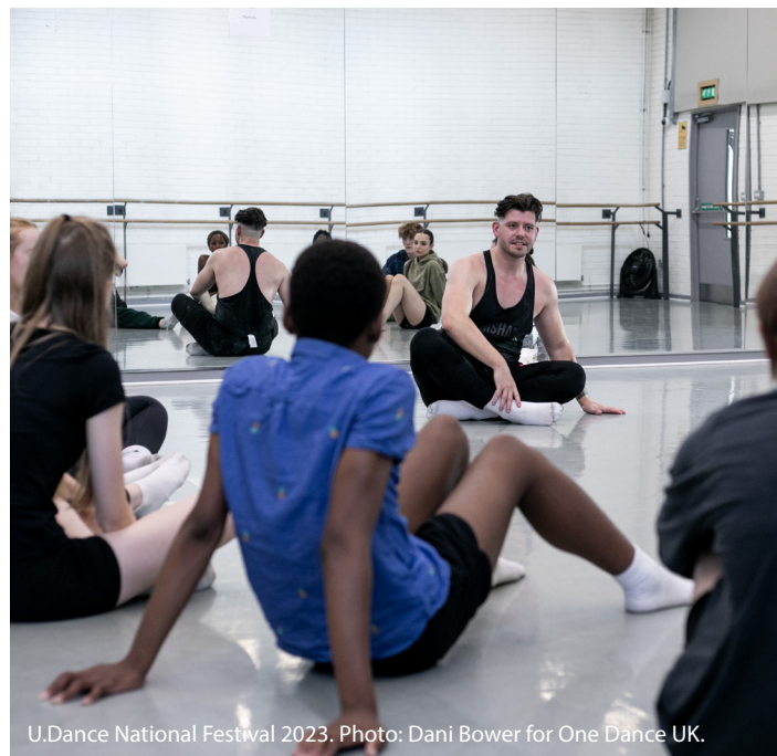
U.Dance National Festival 2023.