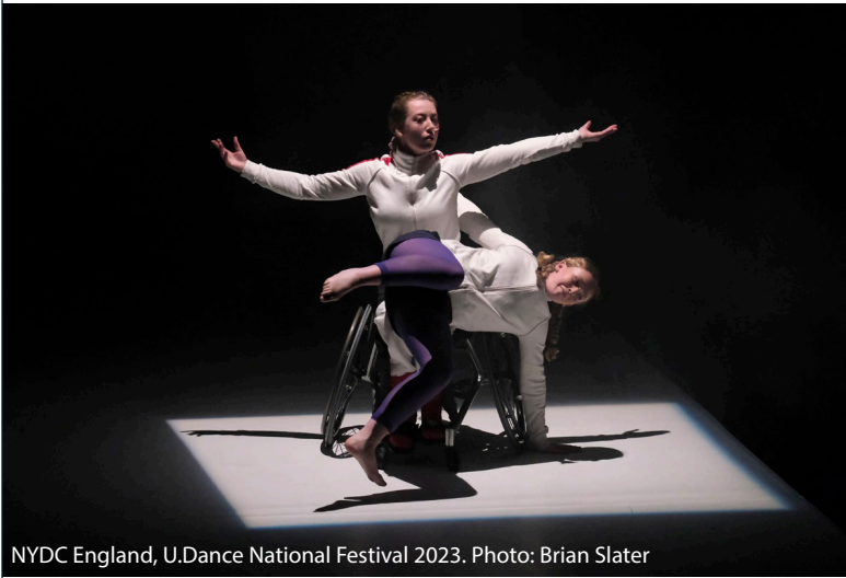
NYDC England, U.Dance National Festival 2023.