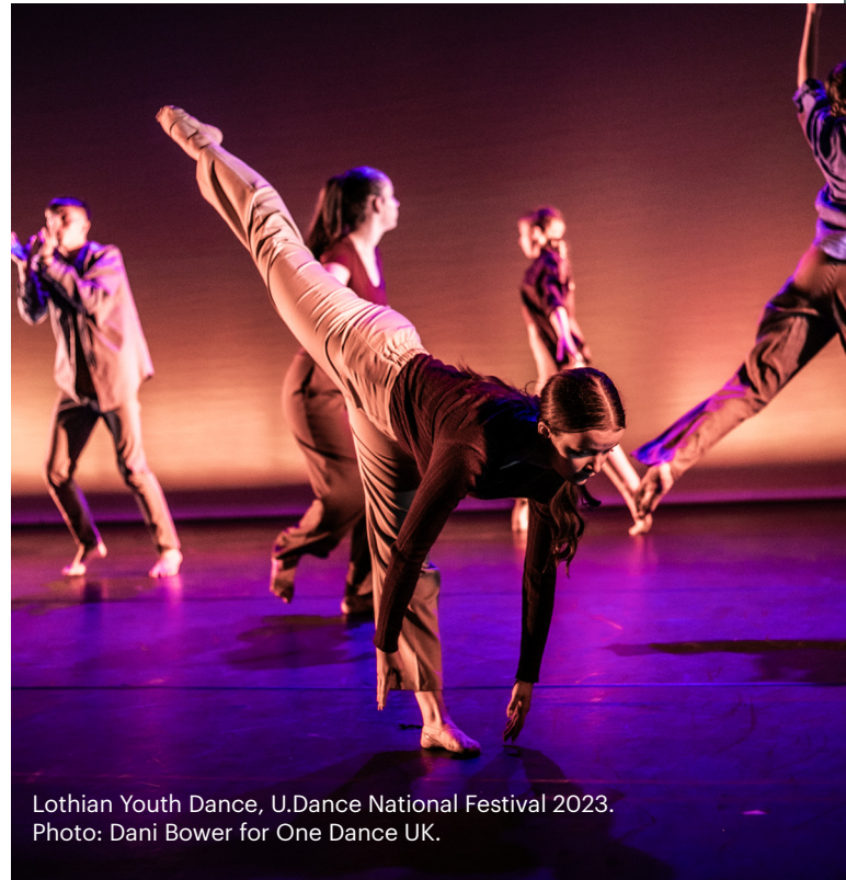
Lothian Youth Dance, U.Dance National Festival 2023.