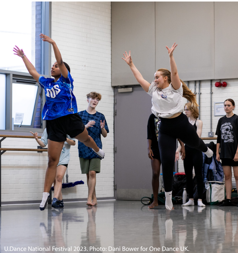
U.Dance National Festival 2023.