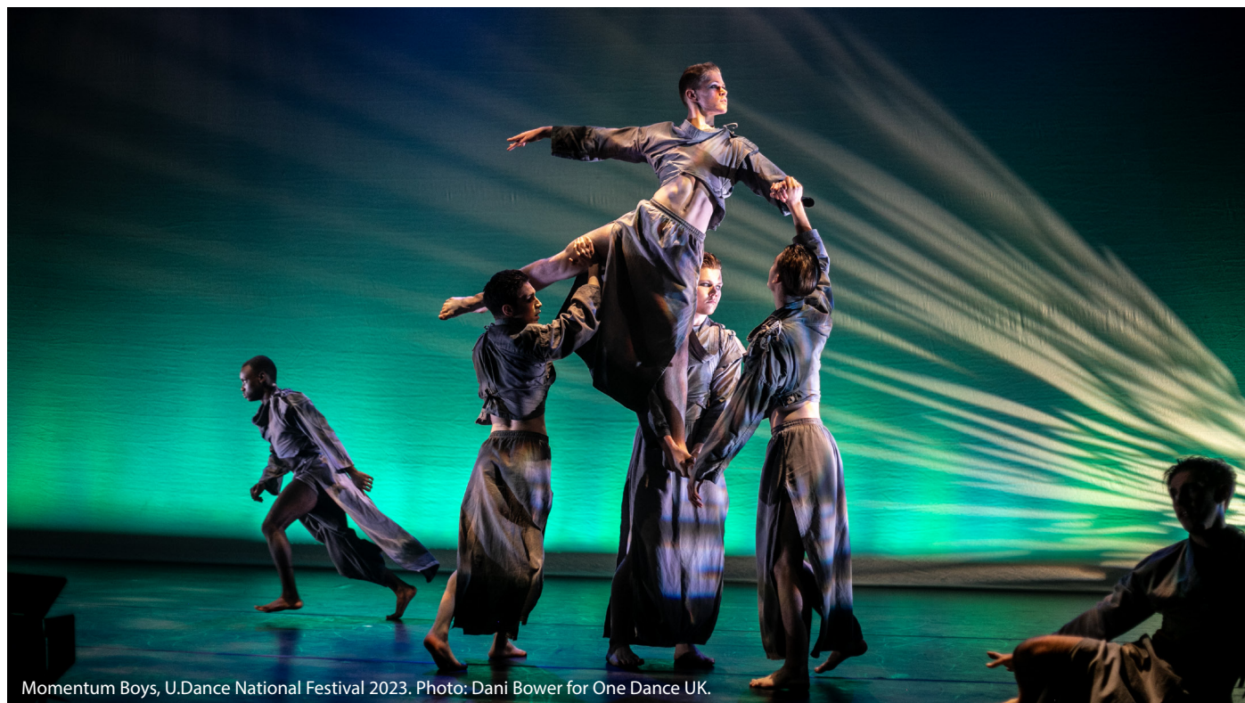
Momentum Boys, U.Dance National Festival 2023.

If you would like your piece to be considered for the U.Dance National Festival ensure you tick the relevant box on the application form. This option is available for both U.Dance on Stage and U.Dance on Screen submissions.