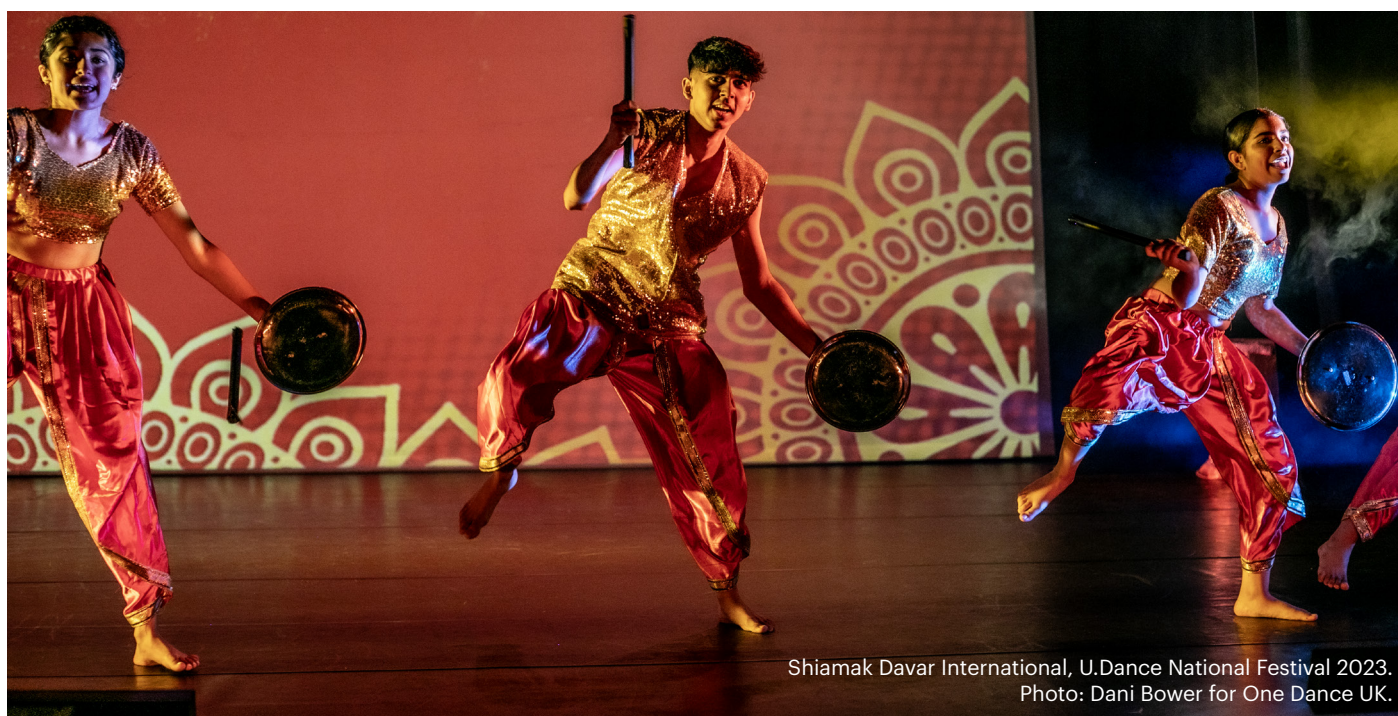
Shiamak Davar International, U.Dance National Festival 2023.

If music rights are not secured, for the online showcase the U.Dance Regional Platform organiser will overlay the track with similar royalty-free music.