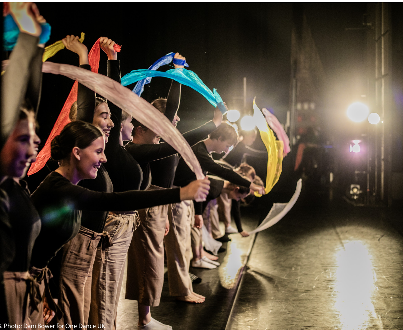
U.Dance National Festival 2023.