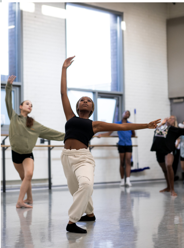
U.Dance National Festival 2023.

A selection panel will select a small number of groups from each U.Dance Regional Platform to have their work showcased at the U.Dance National Festival 2024. Further information relating to the National Panel and criteria are detailed later in this Application Pack.