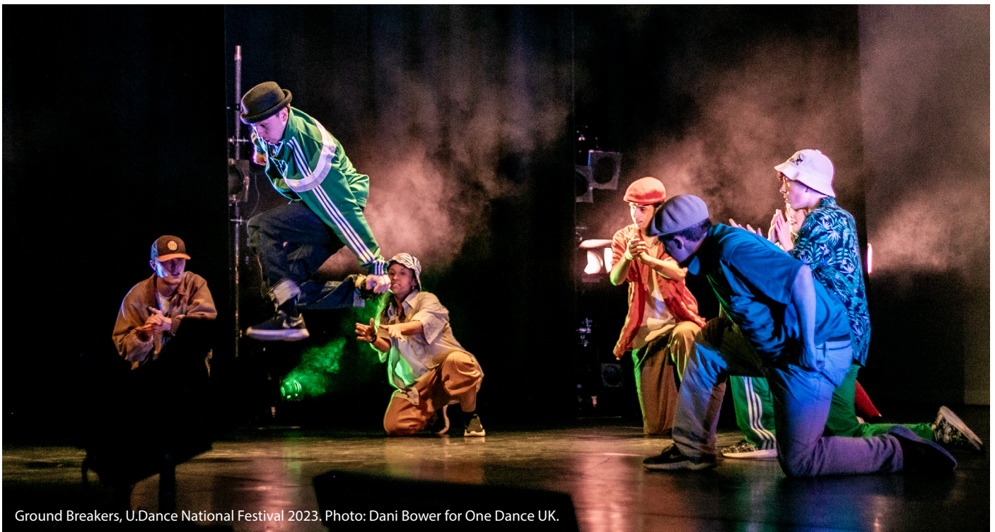
Ground Breakers, U.Dance National Festival 2023.