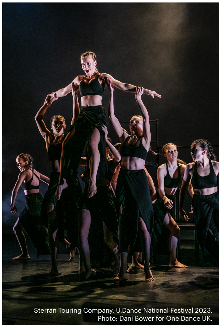
Sterran Touring Company, U.Dance National Festival 2023.

The structure and exact timeline of each U.Dance Regional Platform is unique, and each will have its own application and selection process. Please contact your U.Dance Regional Platform representative for details using the contact information below.